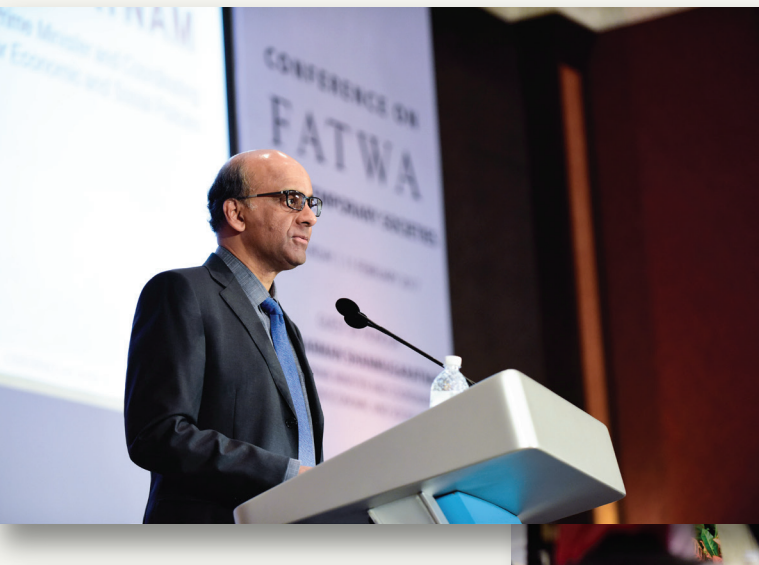
Reference: Fatwa in Contemporary Societies 2017