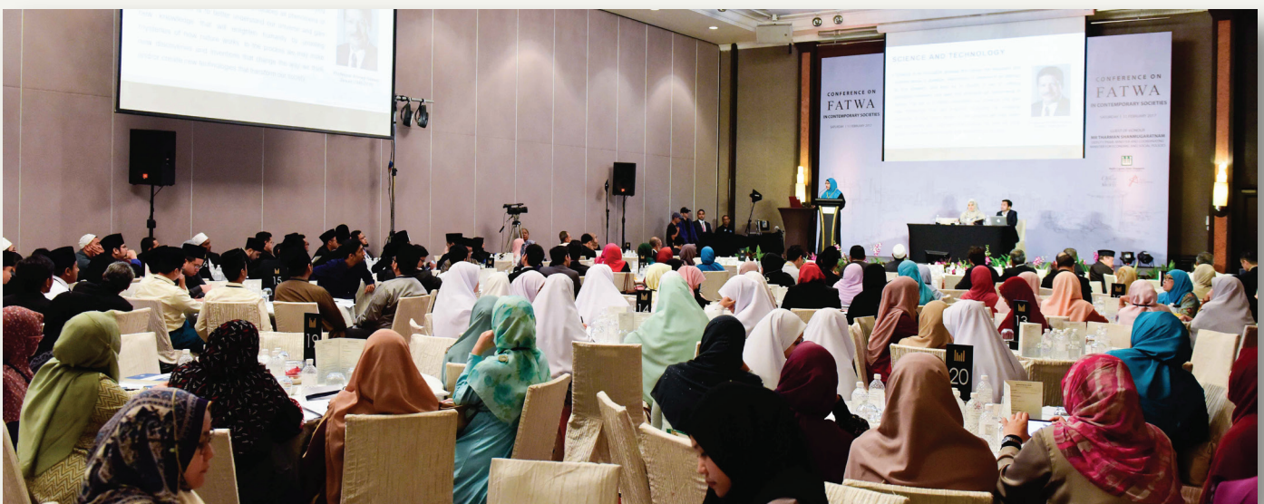
Reference: Conference on Fatwa in Contemporary societies 2017

In Singapore, the fatwa institution plays a pivotal role in shaping the socio-religious life of the Muslim community by offering solutions through religious guidance and Fatwas. Due to the intricate nature of the contemporary conditions and contexts of Muslim societies, religious scholars and experts from diverse backgrounds should engage in constructive and comprehensive dialogue and discussion to find effective solutions to complex issues and challenges.